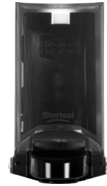
2.5 l Spender (schwarz)