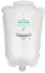
2.5 l Super Handreiniger Beutel